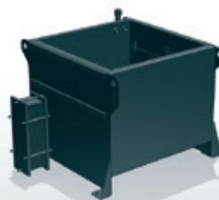
Cooling by means of plate heat exchanger