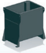
small 800 mm x 600 mm x 920 mm