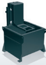
Pneumatic lowering stroke