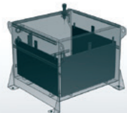
„Autonomous“ cooling basin

For further information, please contact us at info.industries.de@kuka.com