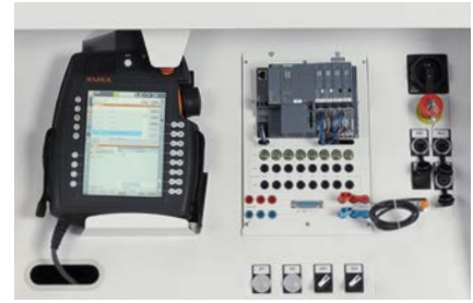
Application package PLC