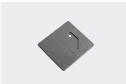
Load spreader plates