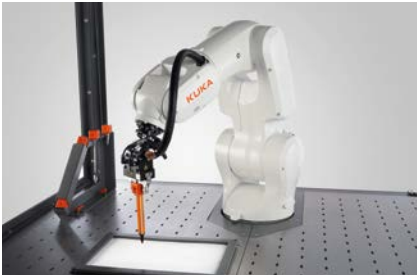
Application package Pro

_Making the professional use of robots easy