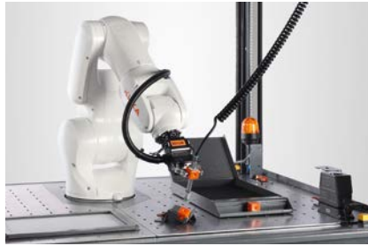
Application package Vision