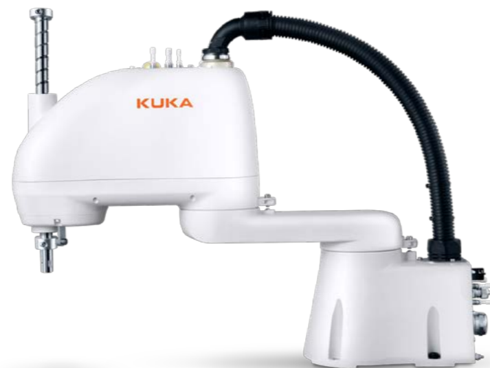
Strong, fast and absolutely reliable. The KR 6 R500 Z200-2 has a payload capacity of 6 kilograms and a reach of 500 millimeters.

The KR SCARA robots have an internally-routed media supply for air, power and data – a complete package for the smart integration of peripheral devices and the quick adaptation of the KR SCARA robot to almost any desired application. From the assembly of small parts to material handling or inspection – the 4-axis KR SCARA robots are characterized by flexible installation, highly precise motion and low maintenance requirements.