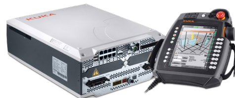
With the new KR C5 micro robot controller for small robots, KUKA is taking automated production to a new level: durable and future-proof.

The KR DELTA delivers with speed, precision, range, reliability, versatility – all with its small footprint. This parallel arm robot was created for pick-and-place tasks focusing on short cycle times and the rapid recognition and handling of objects. With a payload capacity of three kilograms, it is ideal for the automation of order – picking and packing tasks – for example in the electronics industry. One particular strength of all robots in the KR DELTA family is their low maintenance requirements. The ball joints are self-lubricating so that replacement of the lubricant in the reduction gears is never required.