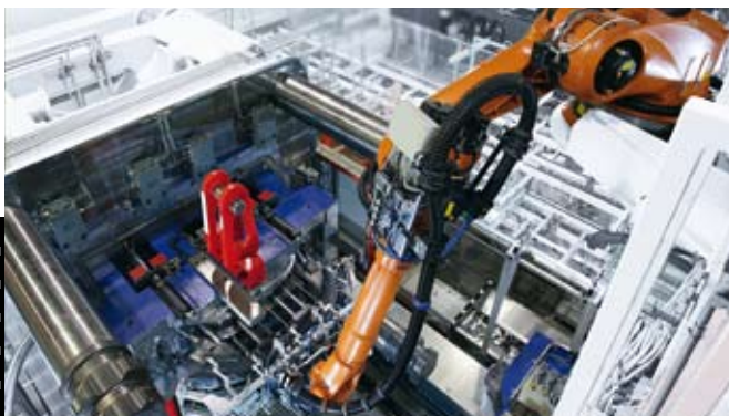
KUKA shelf-mounted robots are ideal for unloading parts from injection molding machines.

Designed for maximum cost-effectiveness: with a low robot base and axis 2 located 400 mm further forward, the shelf-mounted robots are perfect for working from above, for example for efficient removal of castings or plastic parts. Thanks to their low weight, they can also be installed directly on the machine, thereby saving space and enabling them to reach far into the machine with great speed. The advantages: reduced space requirements and improved process optimization.