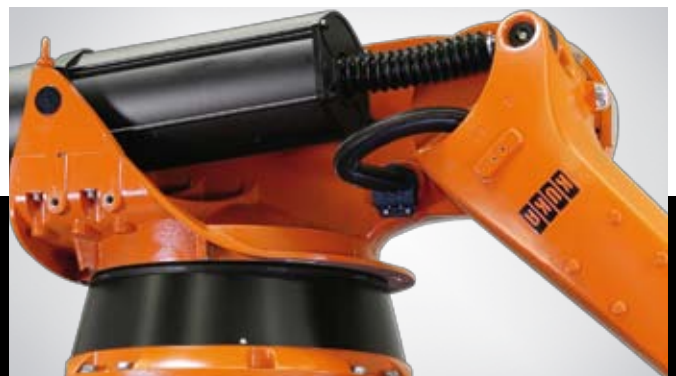
The low base is specially optimized for working downwards.

KUKA offers you a comprehensive range of software. In addition to expandable system software and simulation programs for system design, we also provide you with specific application software, such as KUKA.PlastTech: the software coordinates and optimizes the work process of robots and injection molding machines – thereby reducing the cycle time for production of the parts. The advantages: maximum ease of operation and major time savings.